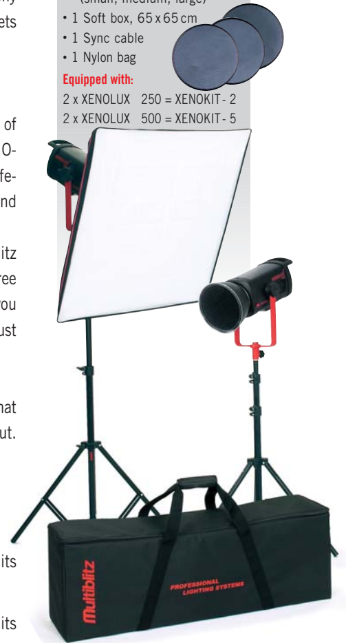
XENOKIT Location Set