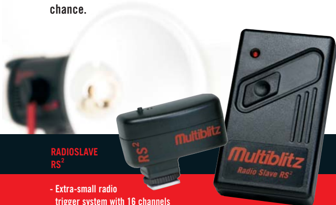
RADIO SLAVE RS 2

In other words, a genuine Multiblitz product leaving nothing to chance.