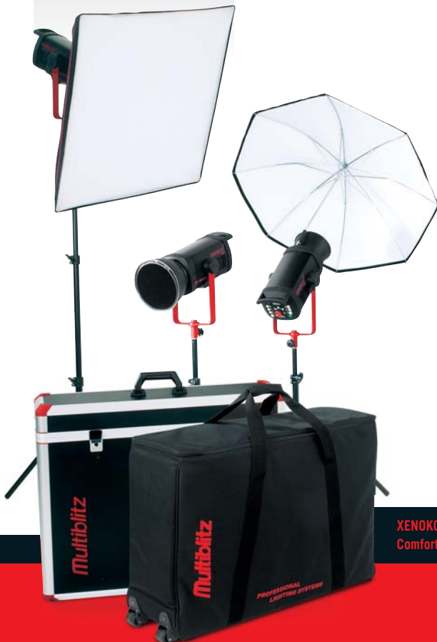
XENOKOM Comfort Set

XENOKOM -10 and -15 without lighting stands and honeycomb filters!